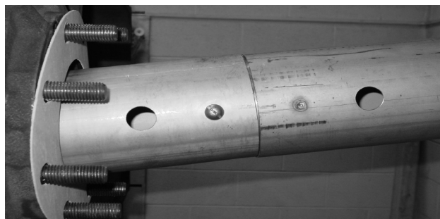
Modular Slide in Installation

throughout all the boiler sections. RTS promotes flow and temperature equalization that results in minimal temperature differentials, effectively eliminating wide temperature variations that are associated with thermal shock and decreased boiler life. RTS is an integral component with no moving parts and will not interfere with prioritized building management control systems.