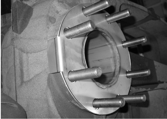
Correct position assured with alignment tab.