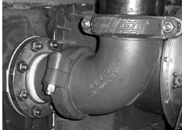
A removable elbow or section of pipe must be attached to the back section return port to allow for RTS removal should removal be required.